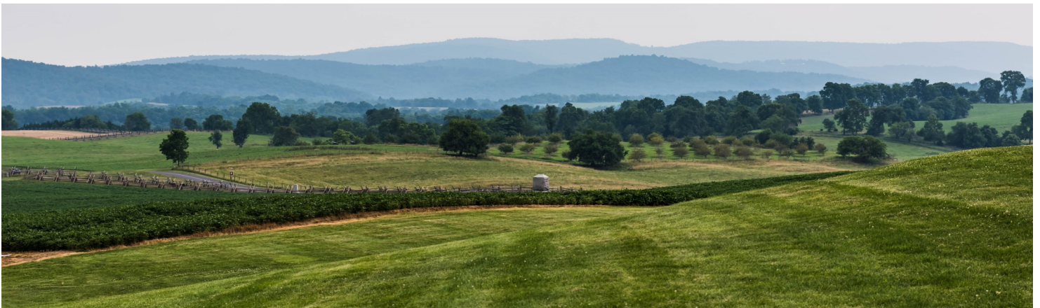
Antietam Photograph by Stuart Harder, Twin Cities Civil War Round Table

As more CWRTs begin to hold in-person meetings, the CWRT Congress has begun shifting its gears, too. After two cancelled annual conferences, Congress leadership decided to hold free online classes on topics that can benefit CWRTs around the country. On October 10 th , we held our first class entitled, CWRTs and the New Normal . It was quickly followed by other Wednesday classes on leadership, newsletter improvement and website analysis. All of our subsequent classes are designed to inspire new ways of thinking about the role of CWRTs and their leaders. Stay tuned to our growing schedule at www.cwrtcongress.org/classroom . And, if you have missed a class, you will find all of them in our CONGRESS VIDEOS under Classroom. We hope you will find them interesting and provocative.