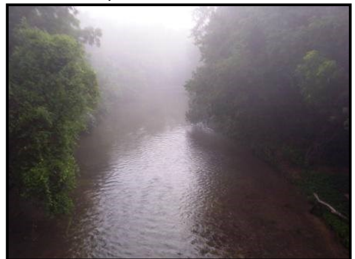
CWRT of the Ozarks Facebook Cover Photo The Battle of Wilson's Creek was fought in August, 1861. It was the largest battle west of the Mississippi and the site of the death of the first general – Union General Nathaniel Lyon.