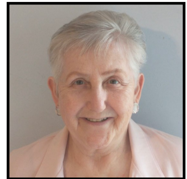
Emerging Civil War.

She has served three terms as President of the Capital District Civil War Round Table, is currently its Secretary, and has been on the CDCWRT board for almost two decades. She is a charter member of Da Buffs, a bimonthly Capital District Civil War study group, a Color Bearer of the American Battlefield Trust, and a regular participant with the